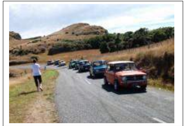
Club members waiting for and trying to assist their fellow 'fallen soldier' .....